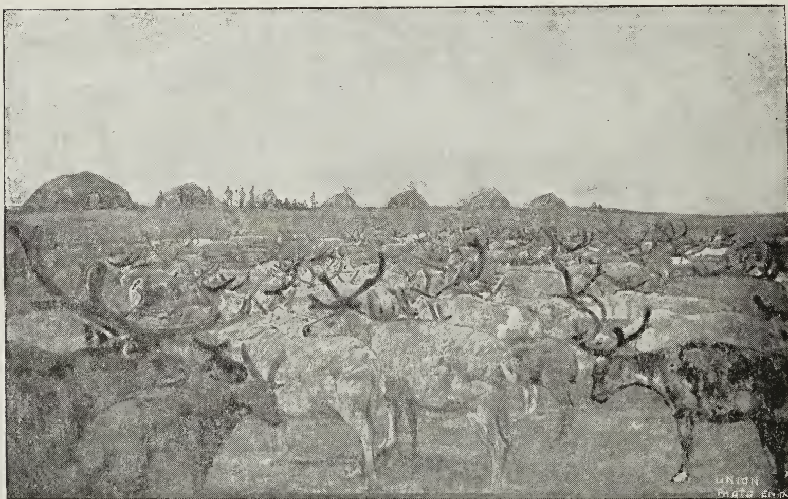
Herd of Domesticated Reindeer, and Temporary Village of Siberian Deermen.